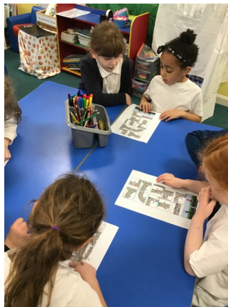
Pictured here are Class 2 talking about how to cross the road safely

For Ethan for displaying excellent friendship qualities.