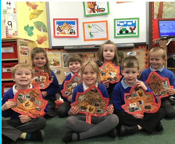
Autumn Art Work from some of our Year 1 children