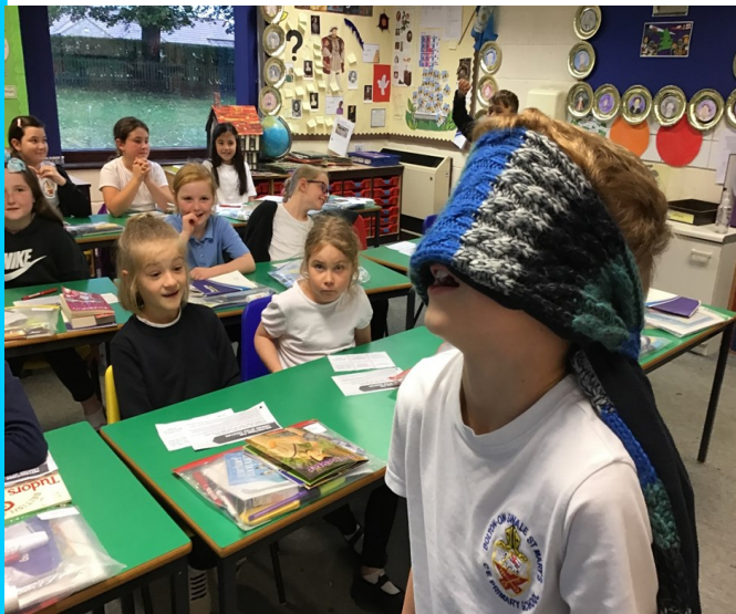
Pictured above Class 3 recording their Science circuits and experiencing darkness in their RE.