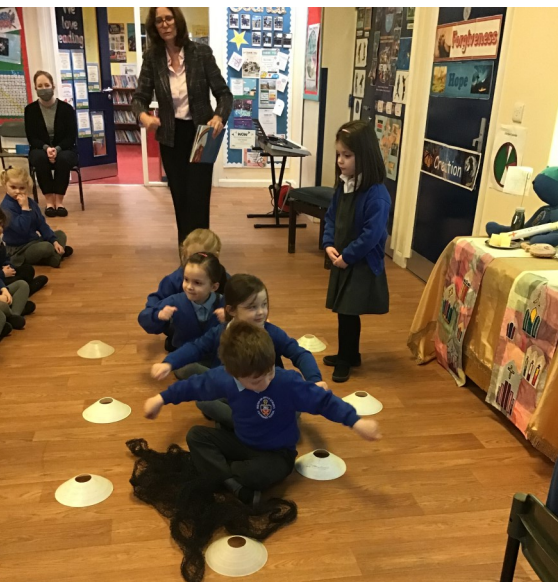
Class 2 recognised 2D and 3D shapes; counting sides on 2D shapes, counting vertices, drawing and creating 2D shapes on Geo boards. In English they have been reading instruction texts, identifying features and writing their own instructions. They had fun in PE and Dance marching like 'real' and 'clockwork' soldiers. In Computing they combined text and images linked to Winter.