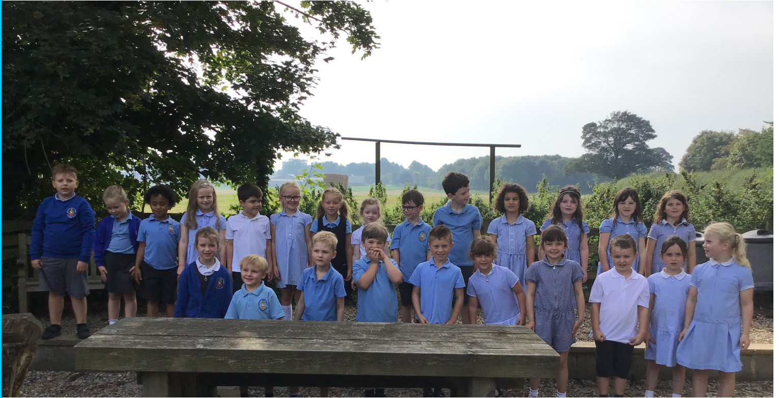
Class 3 look very smart and are enjoying all being part of Key Stage 2.